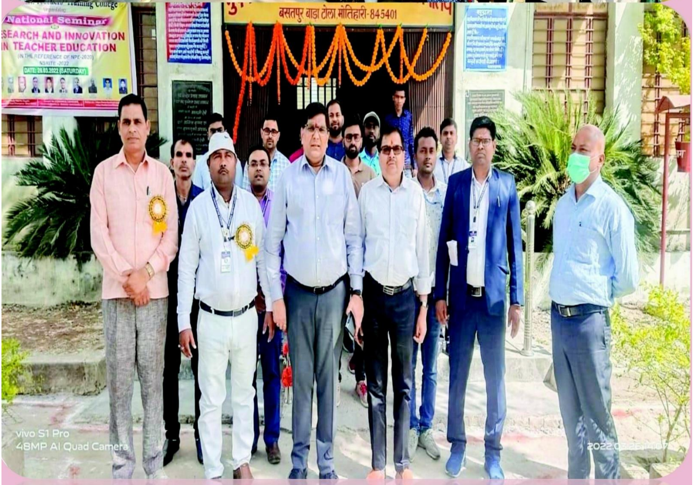
BHUVAN MALTI TEACHERS' TRAINING COLLEGE,