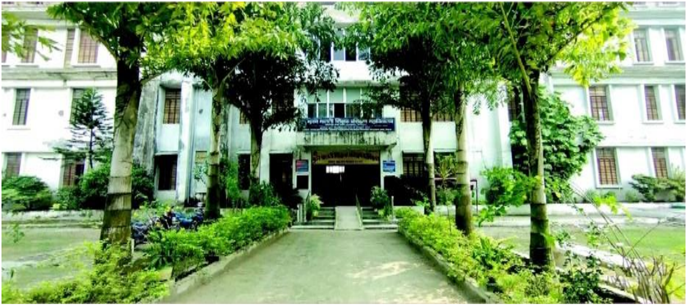
MEMORY OF BHUVAN MALTI TEACHERS' TRAINING COLLEGE, MOTIHARI

Teaching is one of the professions that gives a person the chance to build a healthy academic system for the country. Hence, as a teacher, you will be entrusted with educating children – the future of the country. You will be shaping minds and helping children develop and become all round individuals.